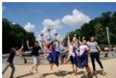
Aussie . . .