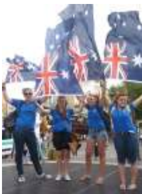
Aussie . . . Aussie . . . Oi! Oi! Oi!

But this year I truly have learnt a lot, more than I ever could have imagined, and it is something I am really grateful for. The most important thing being how truly lucky I am, that I got such an amazing opportunity. Being on exchange has made me so thankful for the place I live in, the people in my life, and the opportunities I am given. So in saying that, I want to finish by thanking Rotary, for giving this incredible experience to me. The places I have been, the people I have met, and the knowledge I have gained, is something I would never give up, no matter what happens from now on. It's been no holiday, but overall I've had such a fantastic year!!! . So thank-you Rotary, for giving me this once in a lifetime experience.